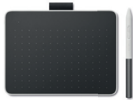
Wacom One S Pen tablet